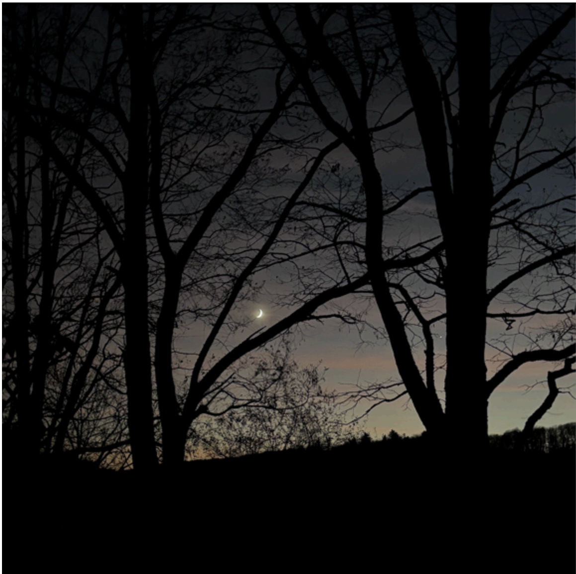
Moon over Putney, November 7, 2024.