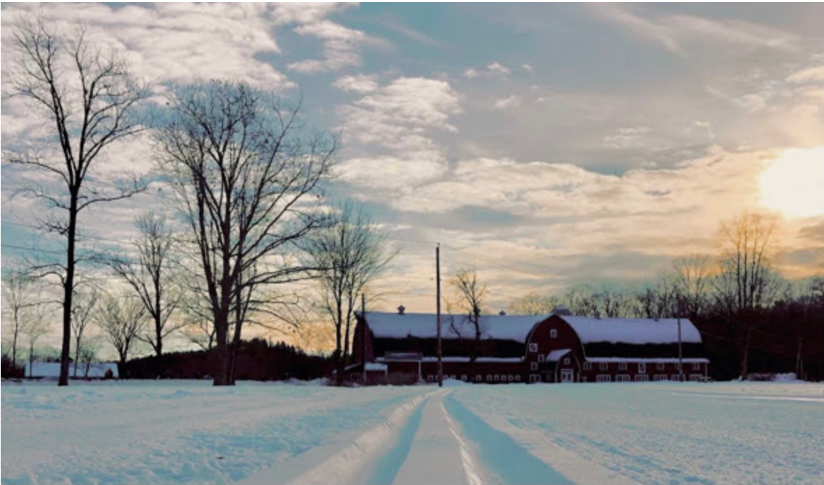
Evening at Putney, Snow and Barn (2022)